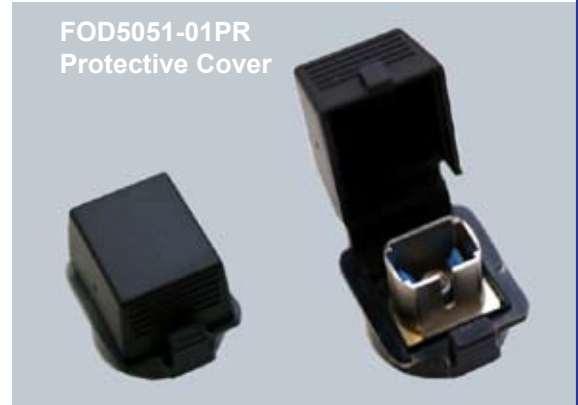
FOD5051-01PR Protective Cover